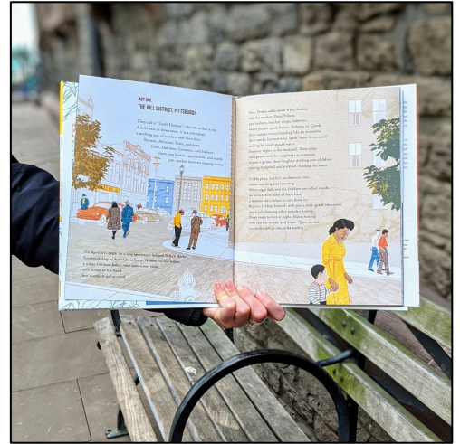
from Feed Your Mind

And here are links to free, downloadable discussion guides for all of my recent books: